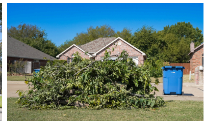
Bulk piles: 3x6x9 ft.