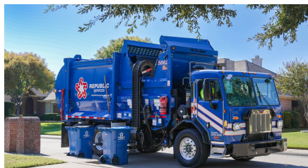
13 ft. clearance above carts