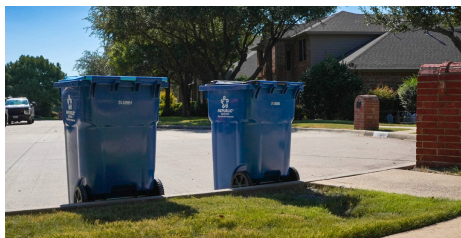
3 ft. between carts, wheels to the curb